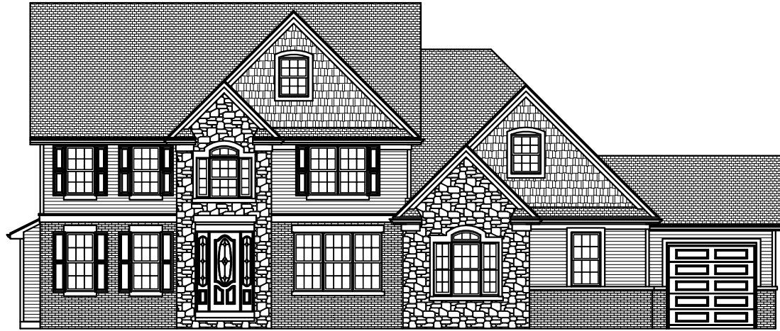
3542 SQ. FT. ABOVE GROUND