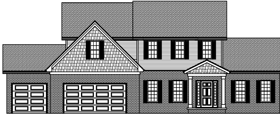
2650 SQ. FT. ABOVE GROUND