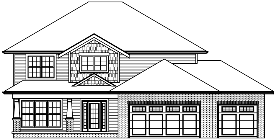
2381 SQ. FT. ABOVE GROUND