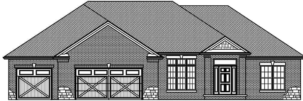
2285 SQ. FT. ABOVE GROUND