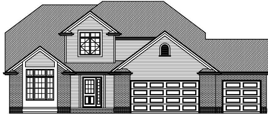
2633 SQ. FT. ABOVE GROUND